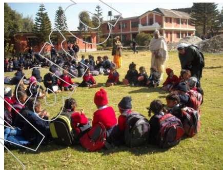
Students at Lunch Break