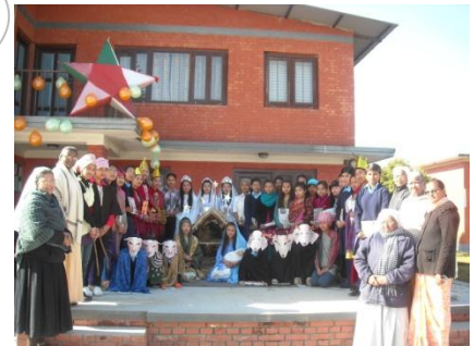
Christmas Celebration Cl.9 (22 nd Dec.2014)