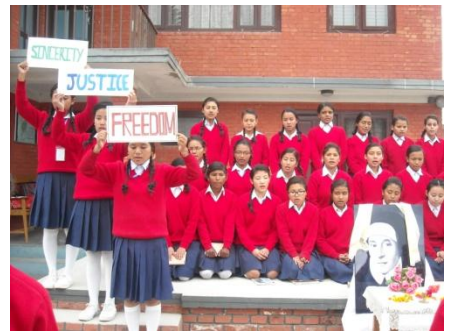
Mary Ward Week, Prayer Assembly 23 rd Jan. to 30 jan 2015